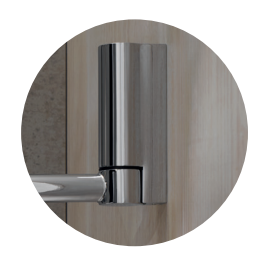
Robust wall mount with swivelling function