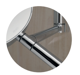
Double hinge for rotating and turning